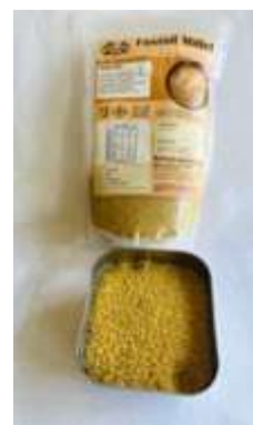
Foxtail कंगनी या टांगुन