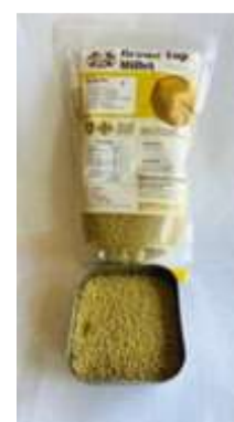
Brown Top मक्रा या मुरात