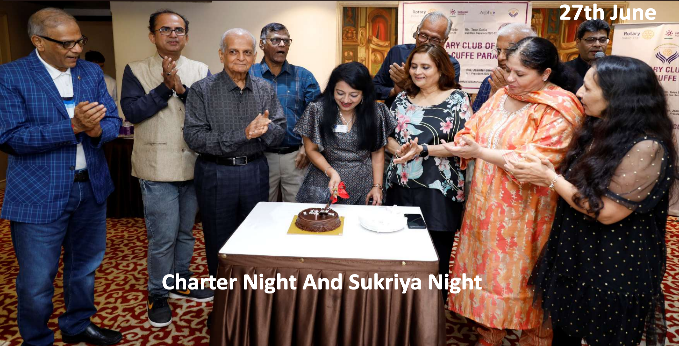
Charter Night And Sukriya Night