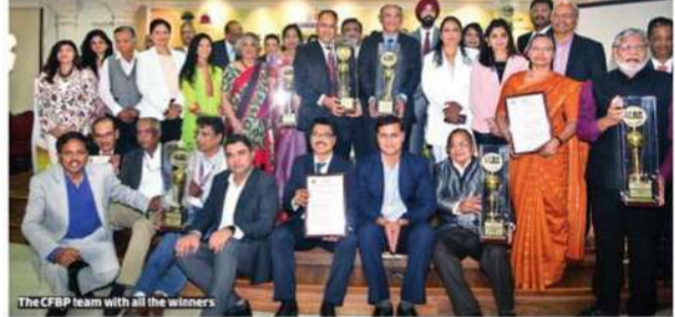
The CFBP team with all the winners

"Given its stratospheric growth, both in size and stature in the past four years, CFBP is spreading its wings nationwide and looks to go global in a few years" — SWAPNIL KOTHARI